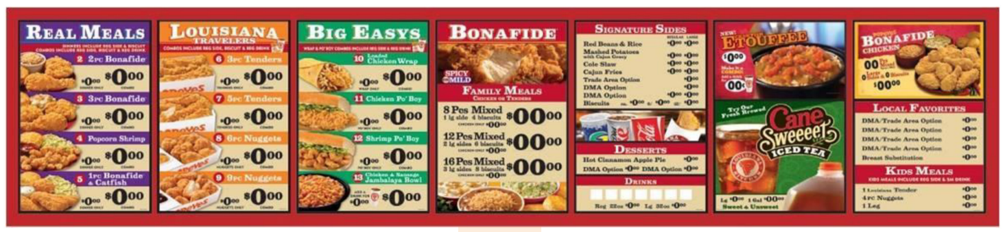
BEFORE : Popeyes "before" menuboard does not clearly communicate the brand's menu categories, the individual products offerings, what comes with a combo and how a combo is different than a dinner.