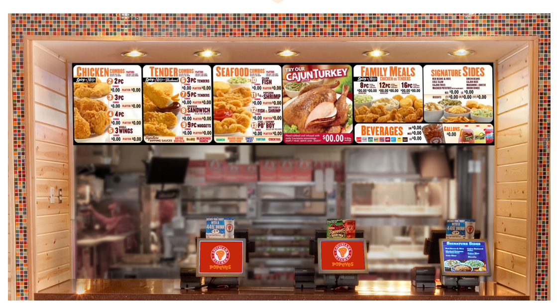
AFTER : Popeyes optimized menuboard is a "revolutionary" change versus the previous design from an organization, layout, look and feel and copy standpoint.

*All artwork, designs and trademarks are intellectual property owned by Popeyes® Louisiana Kitchen.