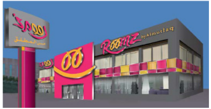
(Above) The new identity was seamlessly integrated into the exterior trade dress and architecture, providing a unique and impactful retail "beacon" that draws customers and distinguishes ROOMZ from other retail concepts.

A key measurement of success in the furniture sector is "sales per square meter". Sales at the new ROOMZ concept are outperforming the original Almutlaq stores by 30% and customers are delighted with the new retail experience.