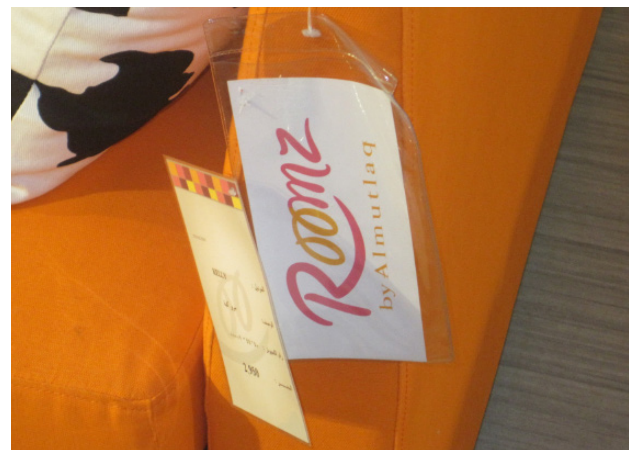
(Above) A comprehensive brand identity manual provides clear guidelines for the correct use of the new brand to a wide range of applications.